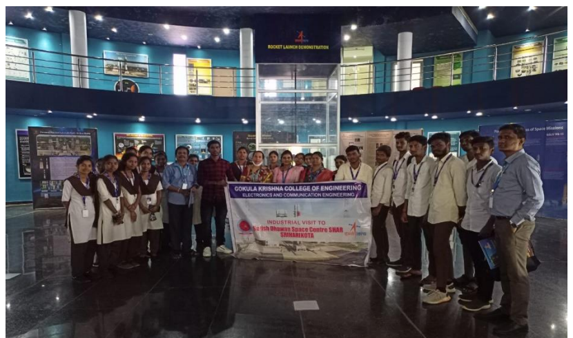
4. space museum